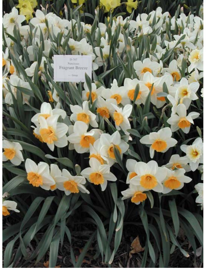
Narcissus 'Fragant Breeze', 4th year flowering from 20 bulbs in Ithaca. This was the 19th ranked cultivar in Ithaca, but still with a fantastic display.

This list could also be used to develop marketing programs for specific locations, for example specifically for Long Island and similar zone 6 climates (using the Long Island data), or for cold zone 5 climates of the northeast and upper midwest (using the Cornell, Ithaca data), or for many regions in the south east (zone 7, using the Clemson data).