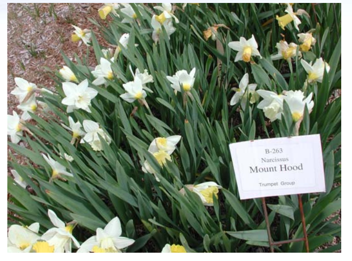
Narcissus 'Mt. Hood', 4th year flowering from 20 bulbs, in Long Island. This cultivar was in the lower third of rankings of all cultivars (sun plots).

Emergence dates ranged from mid-January to Mid-March in Clemson, 27 February to 10 April in Ithaca, from 1 March to 20 March in Long Island. These dates reflect the colder northern climates versus Clemson, but also differences in the Ithaca and Long Island climates. There was little, if any, notable effect of shading on emergence date.