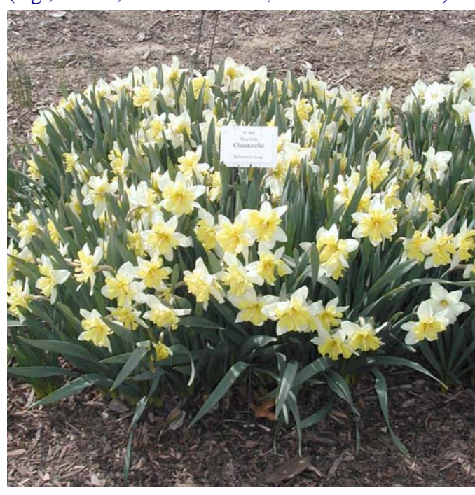
Narcissus 'Chanterelle' from 2004 flowering in Ithaca, 5th highest flowering cultivar.

As pointed out above, the side bulbs were inadvertently removed from the mother bulbs before planting in Clemson, and this obviously reduced the total number of flowers produced per plot in Clemson. Therefore, this might have eliminated a couple of cultivars that were just under the cut in Clemson (e.g., Serola, Standard Value, Holland Sensation).