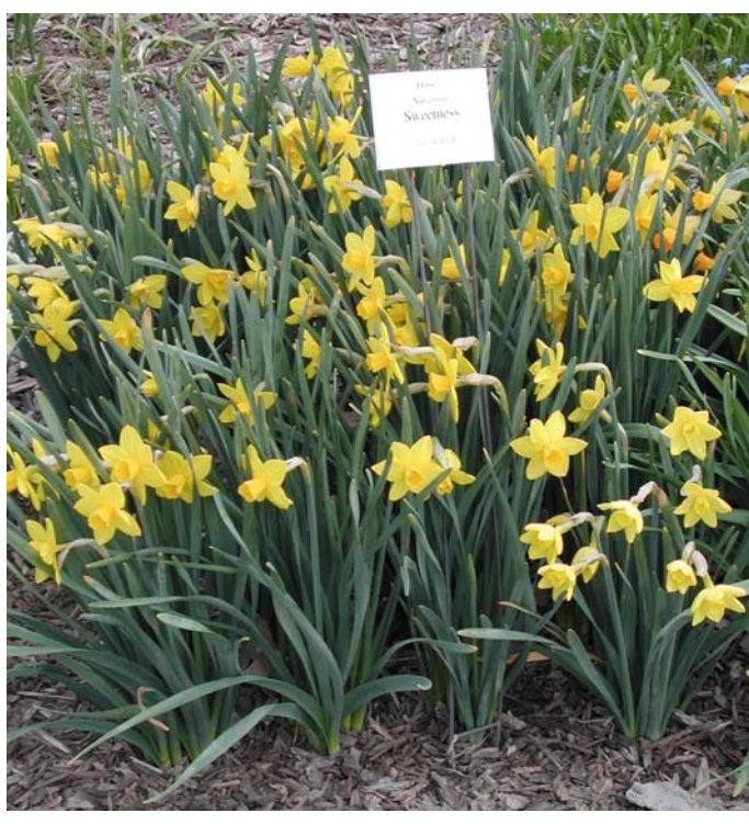
'Sweetness' from 2003 (4rd year of flowering) in Ithaca. Compare with nearby photo of year 3 flowering.