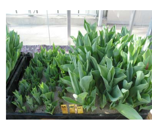
Christmas Marvel during forcing. Left: bulbs treated with ethylene. Right: bulbs treated with same amounts of ethylene, but treated with FreshStart every 12 days.

From these experiments it could be concluded that all negative effects of ethylene tulip on bulbs could be prevented treating the bulbs with 0.2 ppm FreshStart during 12 to 24 h. For a