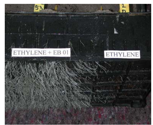
Effects of ehtylene on rooting. Left: ethylene plus FreshStart.

In one experiment planting stock from 4 cultivars was treated with 15 ppm ethylene for 2 months continuously. Half of the bulbs were treated with Fresh-Start every 12 days. The bulbs were planted in November and lifted next summer. As a consequence of the ethylene treatment the yield of saleable sizes was reduced by 80 to 90% (!). In the bulbs that were treated with FreshStart the yield of saleable sizes was as high as in the clean air control, while they had been subjected to the same ethylene concentrations. This shows that FreshStart protects planting stock from ethylene-induced splitting for 100%.