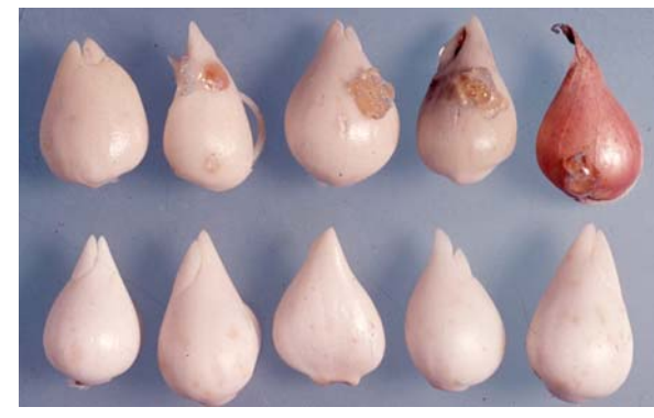
Ethylene-induced gummosis can be prevented with FreshStart.