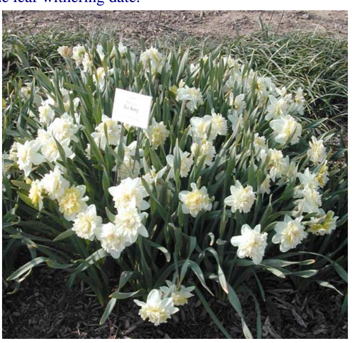
Narcissus 'Ice King' from 2004 flowering in Ithaca. This was the third-highest rated cultivar in Ithaca, based on number of flowers.

In Clemson, leaves withered from about mid-May to the first week of June. In the northern sites, dates of leaf withering ranged from 25 May to 25 July in Ithaca, and from 6 June to mid-August on Long Island. In this case, the shade tended to delay leaf senescence, that is, it occurred later, typically by 3-10 days, depending on the cultivar. In approximately half of the cultivars, however, shade did not change the leaf withering date.